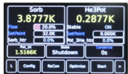
Front panel of MercuryiTC in Heliox mode.

For instance, the Heliox mode is used to control a single shot helium-3 refrigerator