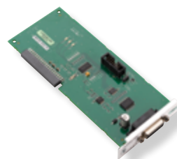
Gas flow control